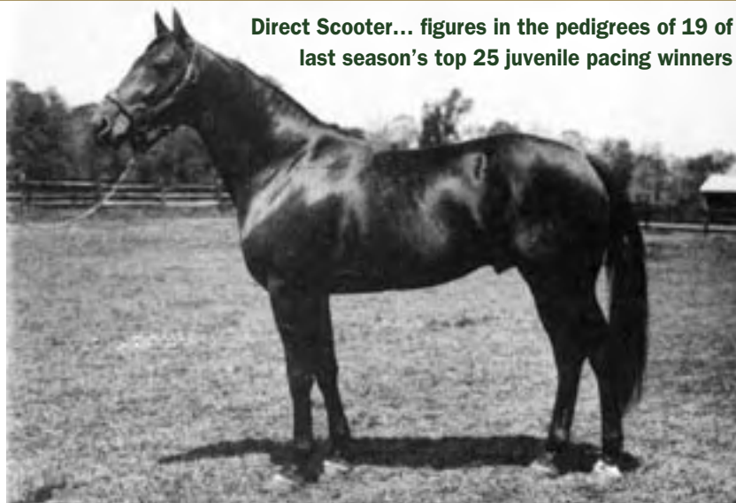
Direct Scooter... figures in the pedigrees of 19 of last season's top 25 juvenile pacing winners

They are generally bred for the sales and they have been selected provided they fulfil the minimum requirements or criteria i.e. sufficiently good pedigree, type and conformation.