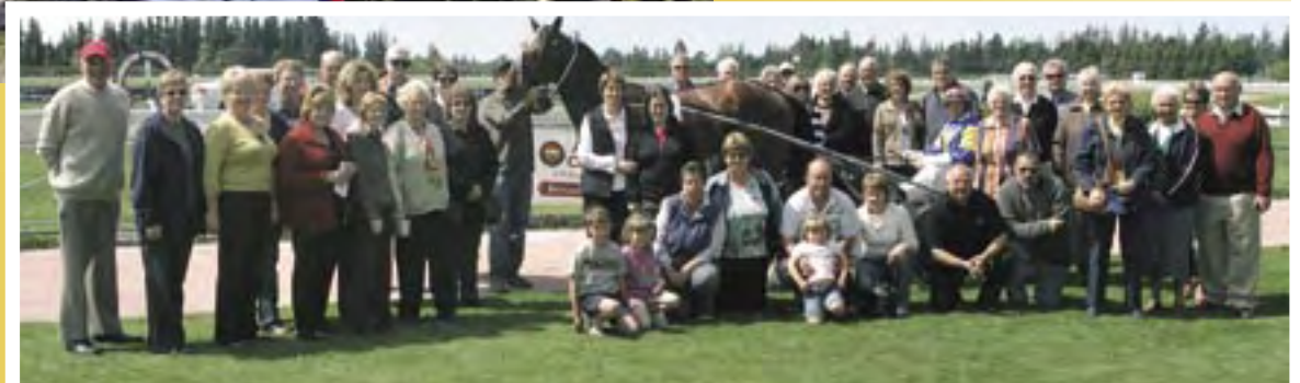
The many syndicate members of the Met 4 Texas Hold Em Syndicate

These syndicated horses purchased at the