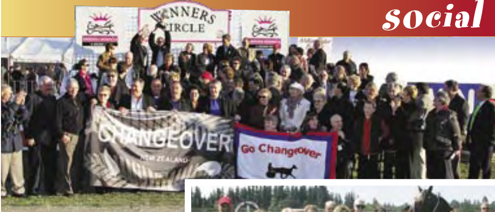
The jubilant syndicate members of the ATC Trot 2006 Syndicate after Changeover wins the $200,000 Breeders Crown Final in Melbourne