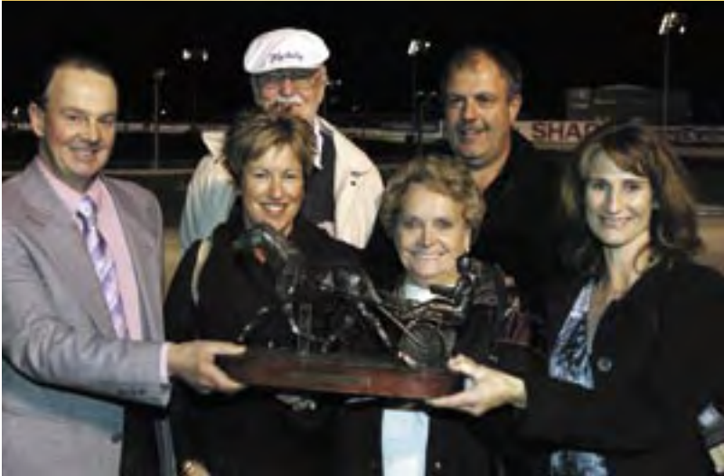
Fiery Falcon Syndicate